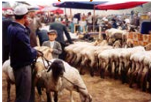
Sunday Bazaar, Kashgar