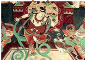
Mogao Cave, Dunhuang

Meals: Breakfast / Lunch / Dinner included