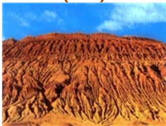
Flaming Mountain, Turpan

After breakfast, you set off for your tour of Turpan, an oasis town 154 meters below sea level. You start with the Flaming Mountain, of the Monkey God fame (take photo on the way); the ruins of Gao Chang , an ancient Chinese Silk Road garrison town where you will be taken by donkey cart to visit the temple area; and the Bezeklik Caves ; where "Bezeklik" means "a place with beautiful decorations". Enjoy lunch under the grape tree with local family .