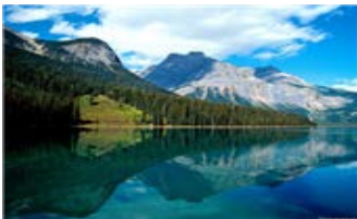
Heavenly Lake, Xinjiang

Fly Kashgar/Urumqi CZ6812 1045/1235 (1h50m)